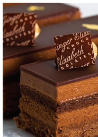
From left to right: Dive Bar, Margarita from Zocalo, Sacramento skyline, Ginger Elizabeth Chocolates